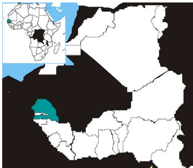
Figure 1: Senegal

Senegal, with a geographic area of 196,840 sq km, is bordered by the Atlantic Ocean, Mauritania, Mali, Guinea, Guinea-Bissau, and Gambia – which penetrates more than 320km into Senegal. Well-defined dry and humid seasons result from northeast winter winds and southwest summer winds.